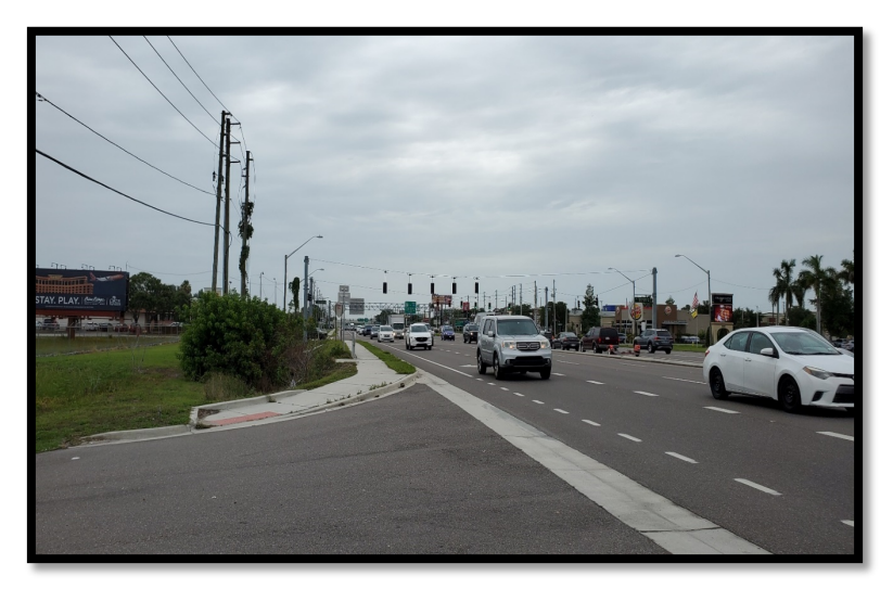
Looking east along Ulmerton Road