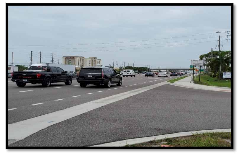
Looking west along Ulmerton Road