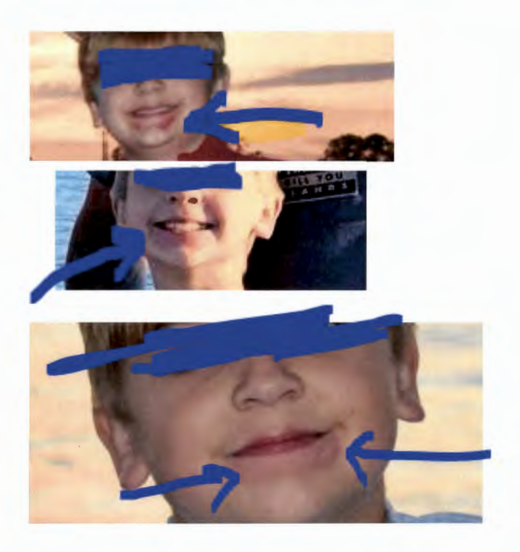
Photo of my sons mouth rash after wearing a wet mask all day – doctors suggest to keep it dry as possible. Not possible with a mask, some of these were taken earlier in the year prior to his braces being put on in Feb 2021 but they are all during the mask mandate