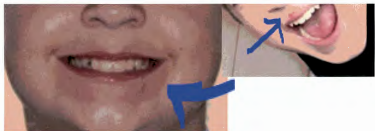
This below shows you it is starting to scar