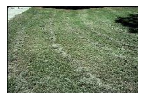
Figure 2 - Remove Large Clumps of Clippings by Mechanical Blowing or Collecting