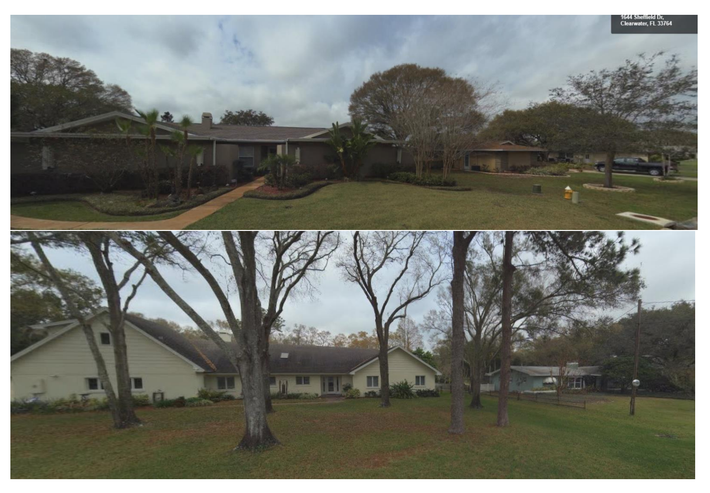
ABOVE: Typical lot density in neighborhoods and surrounding half mile radius of proposed development. These lot's density represent 90% of all lot density within a half mile radius of proposed development.

BELOW: Small enclave the that matches density Developer requests. This small neighborhood enclave (next to proposed development) represents only 10% of existing lot densities within half mile radius. This small (3-4 block) neighborhood represents more than half of all police calls within a one mile radius.