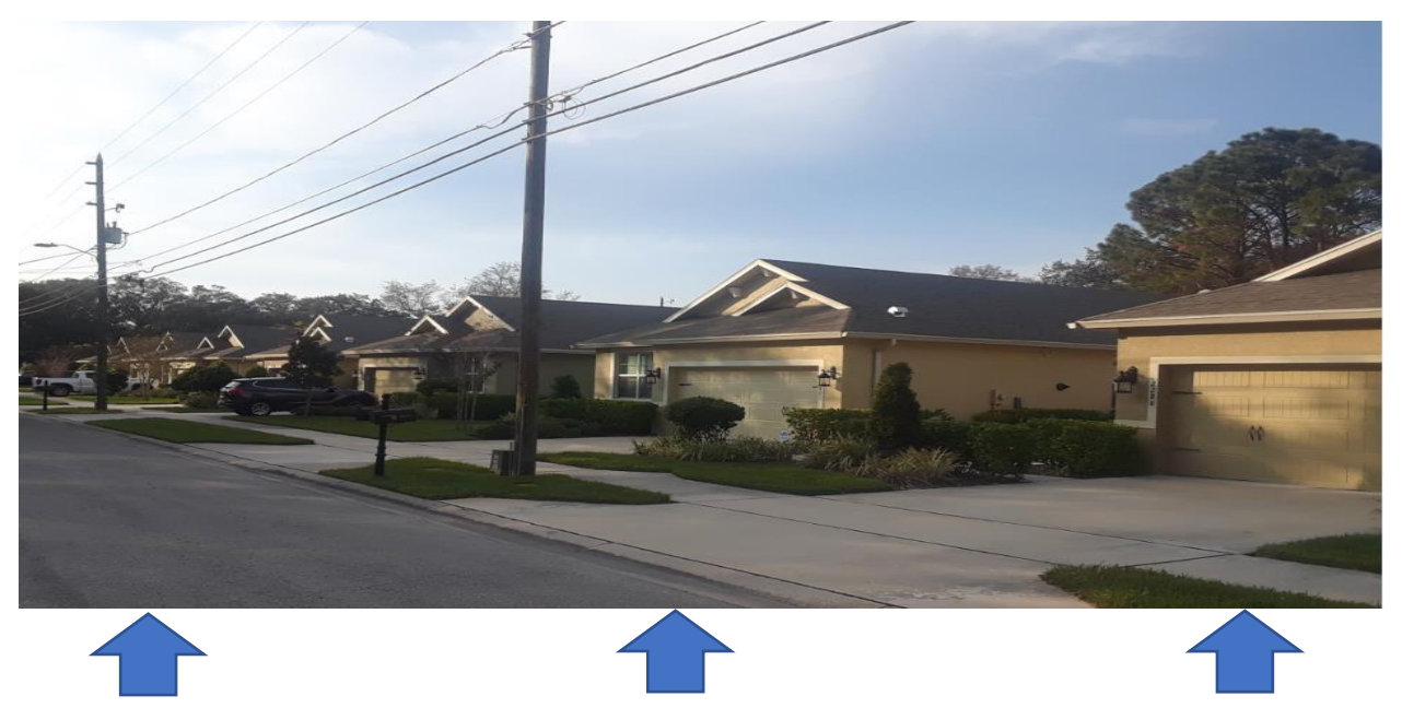
This is proposed housing density developer requesting. NOT IN congruence with current neighborhood . Average lot size 5000 sq. ft ./ no yards / inappropriately close to street / all garage door frontage....etc.

Below is Lawton Dr. (adjacent to proposed development). Average lot size 15k sq. ft. These home's lot sizes are typical of 95% of all homes within one half mile of proposed development.