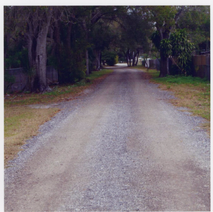
windresten making Nonth