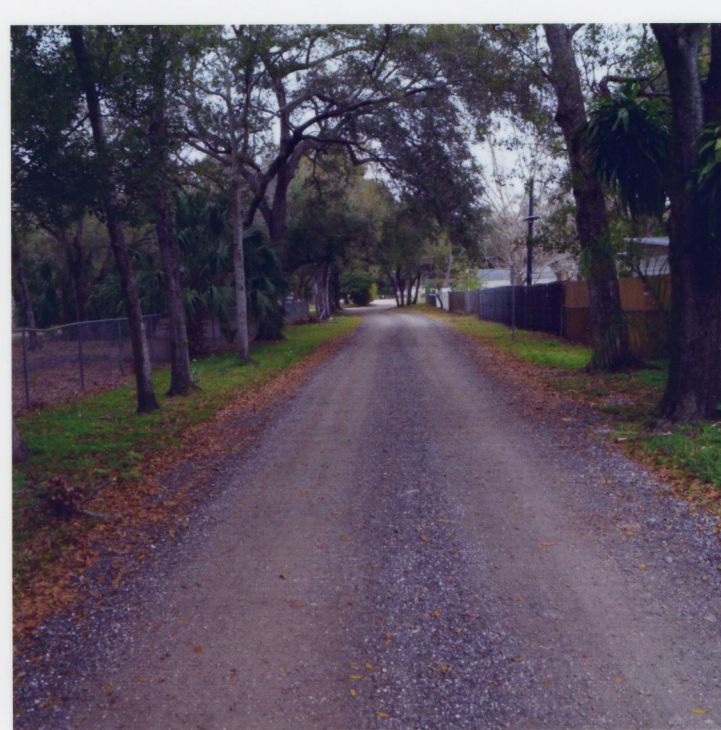
North Winchester / parcel on 1eft