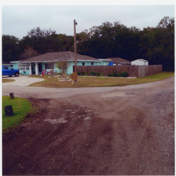
haudton / winchester Intersection