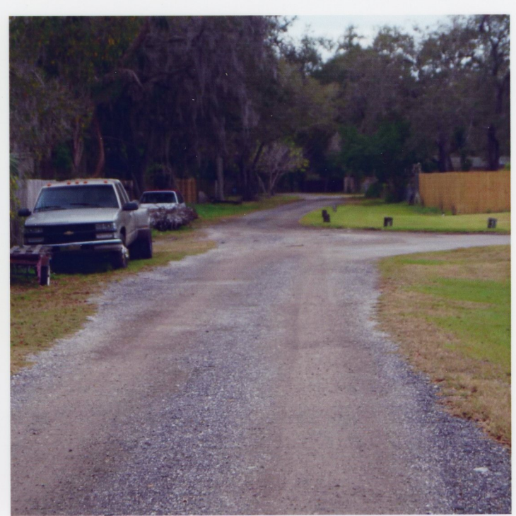
Intersection with houstor