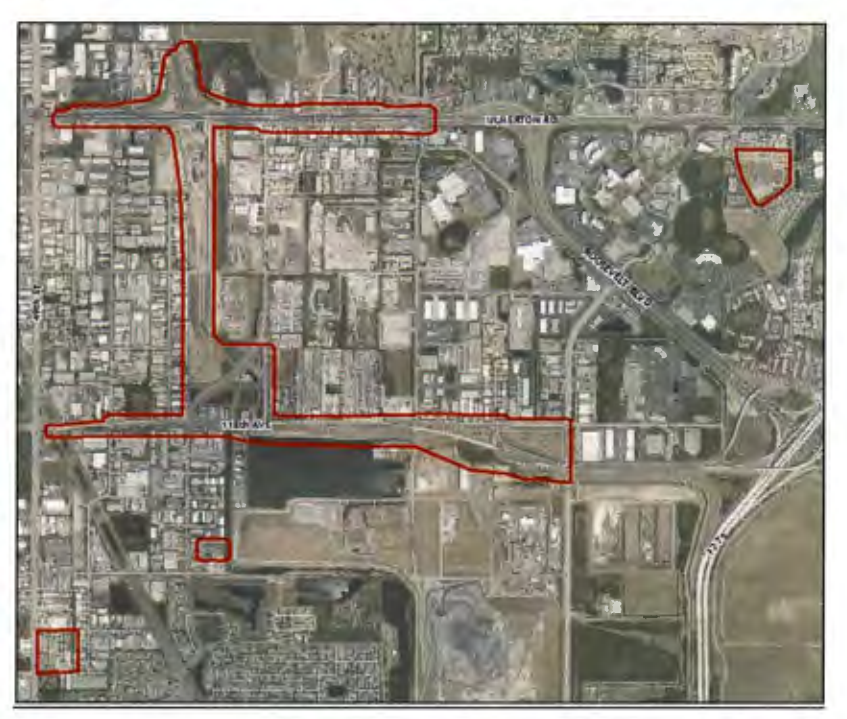
Figure 1 – Post Date Certain Projects to Be Included in Model

Missing Breakline Review and Update: It is SAI's understanding that breaklines were not developed by USGS/FDEM for wet ponds and/or depressional areas less than 2 acres in size. SAI will review the LiDAR