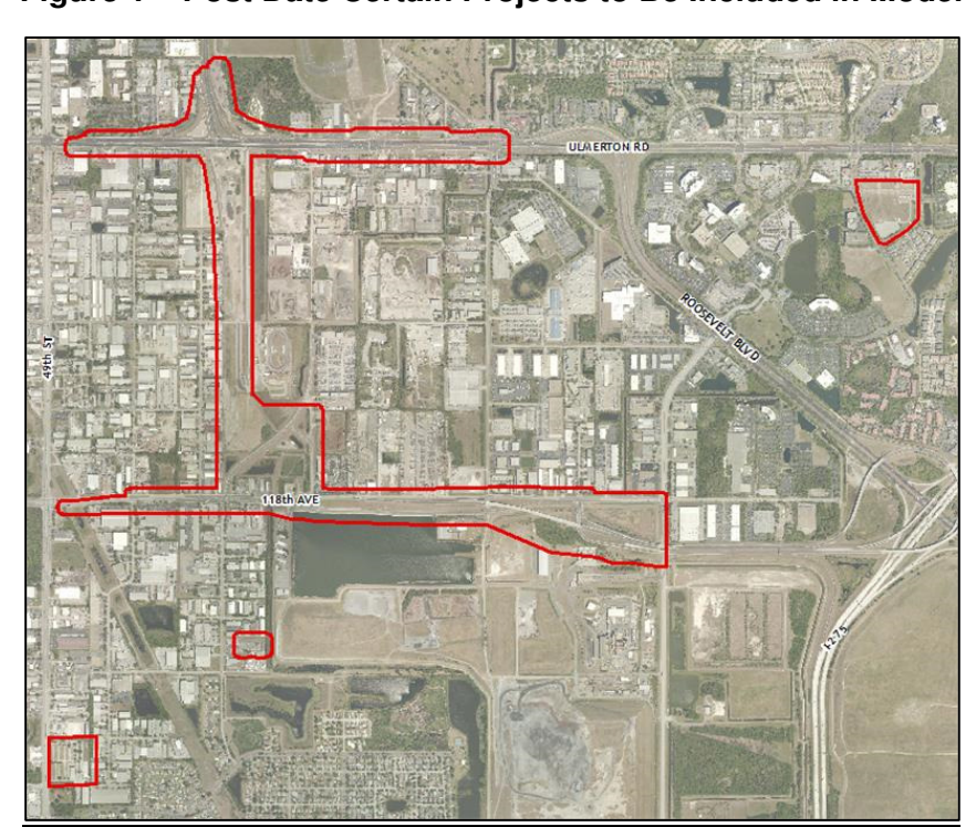
Figure 1 – Post Date Certain Projects to Be Included in Model

Missing Breakline Review and Update: It is SAI's understanding that breaklines were not developed by USGS/FDEM for wet ponds and/or depressional areas less than 2 acres in size. SAI will review the LiDAR