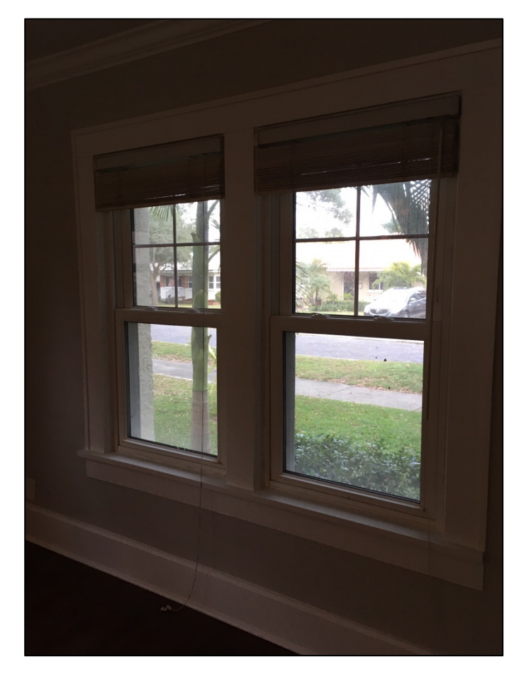
Figure 5: New windows