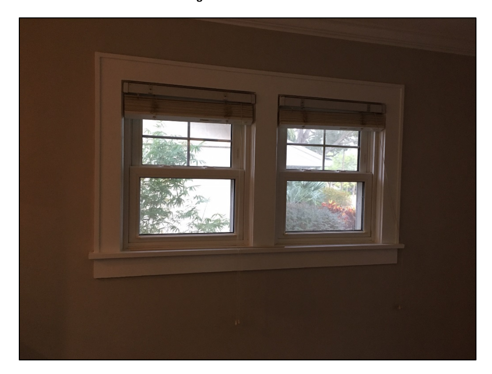
Figure 6: New windows