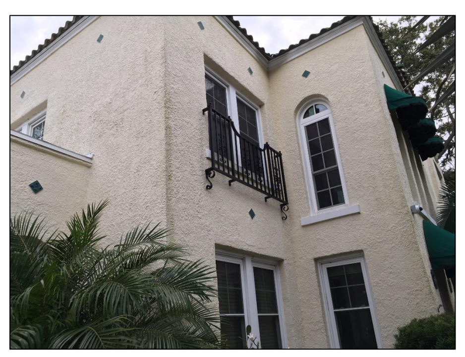
Figure 14: Elevation showing replacement windows