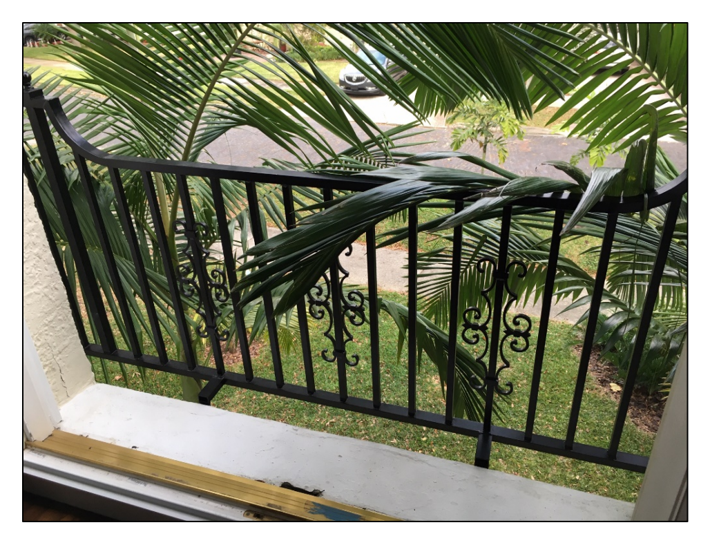
Figure 9: New balconette on front facade