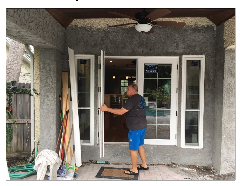
Figure 10: Structural repairs to rear wall of building and covered porch