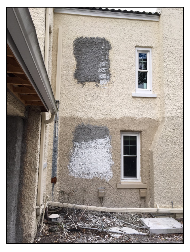
Figure 11: Removed glass block windows and new window replacements