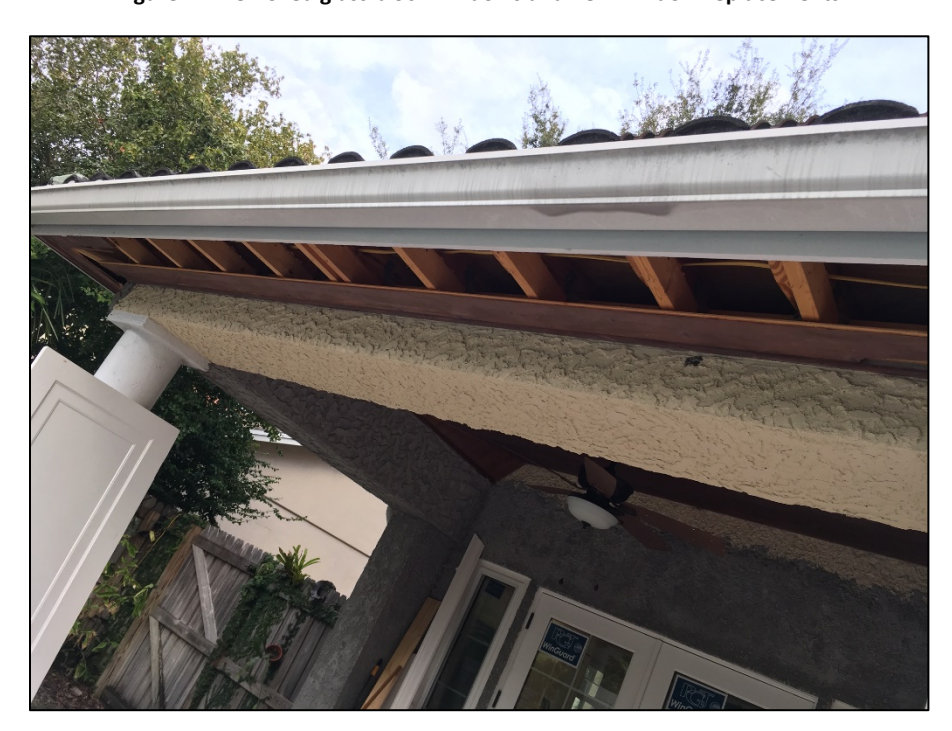
Figure 12: Repaired exterior rear porch