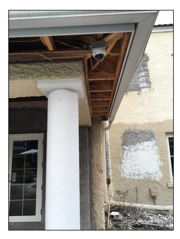
Figure 13: Repaired exterior rear porch