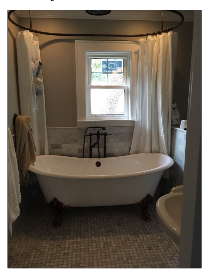
Figure 16: Renovated bathroom