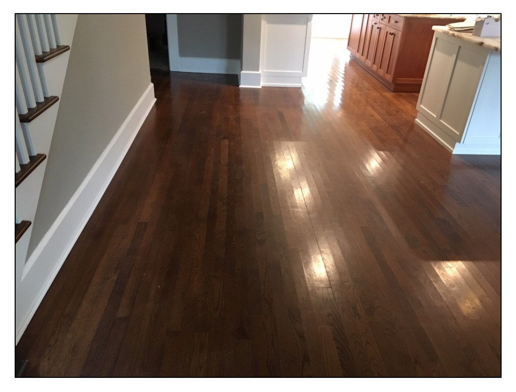
Figure 3: Restored wood flooring