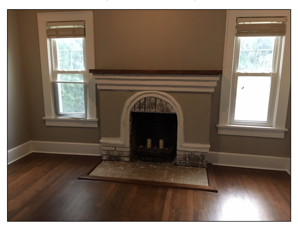
Figure 4: Repaired plaster and fireplace