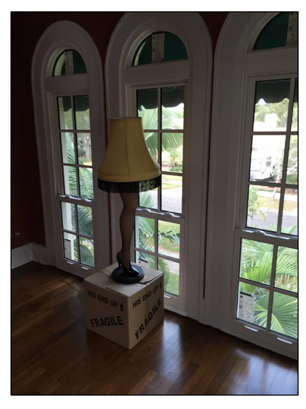
Figure 7: New windows