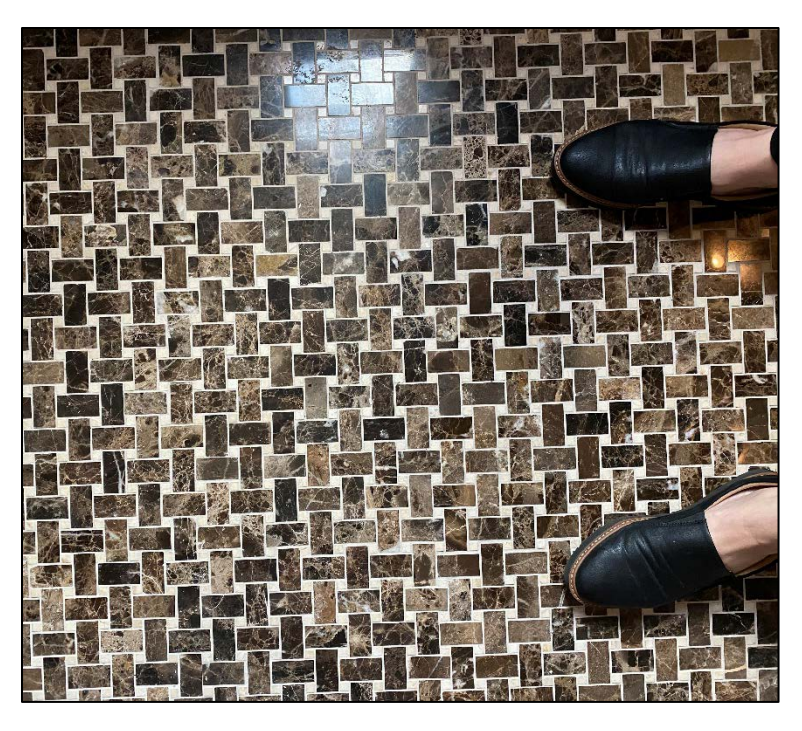
Figure 15: Basket weave tile in bathroom