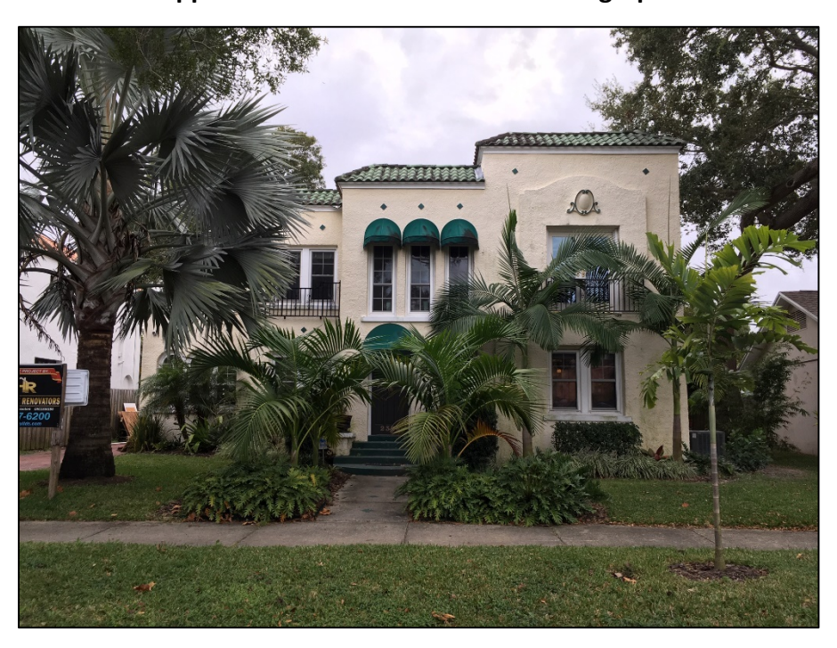
Figure 1: Front façade of subject property, post-construction