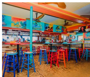
Allowed at tabletops