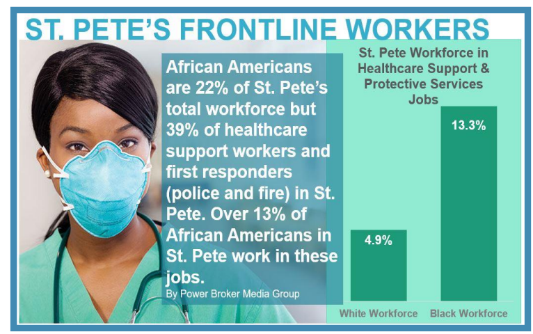
*Graph includes healthcare techs, healthcare support workers and protective service workers (firefighting and prevention, and other workers + law enforcement workers

Investments through PCUL and POC will help these workers cover added burdens such as childcare, car repairs, gas cards to cover the added needs of workers and children, and the costs of food during homeschool hours (often covered by grandparents and other relatives).