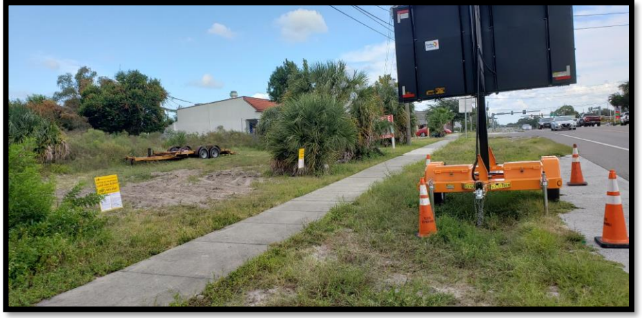
Looking to the south along US Alt 19