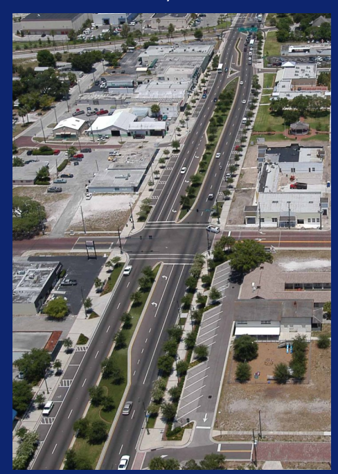
West Bay expansion and landscaping 2001

2. Documentation of improvements in the aesthetic conditions of buildings, improved maintenance and landscaping throughout the District over 15 years.