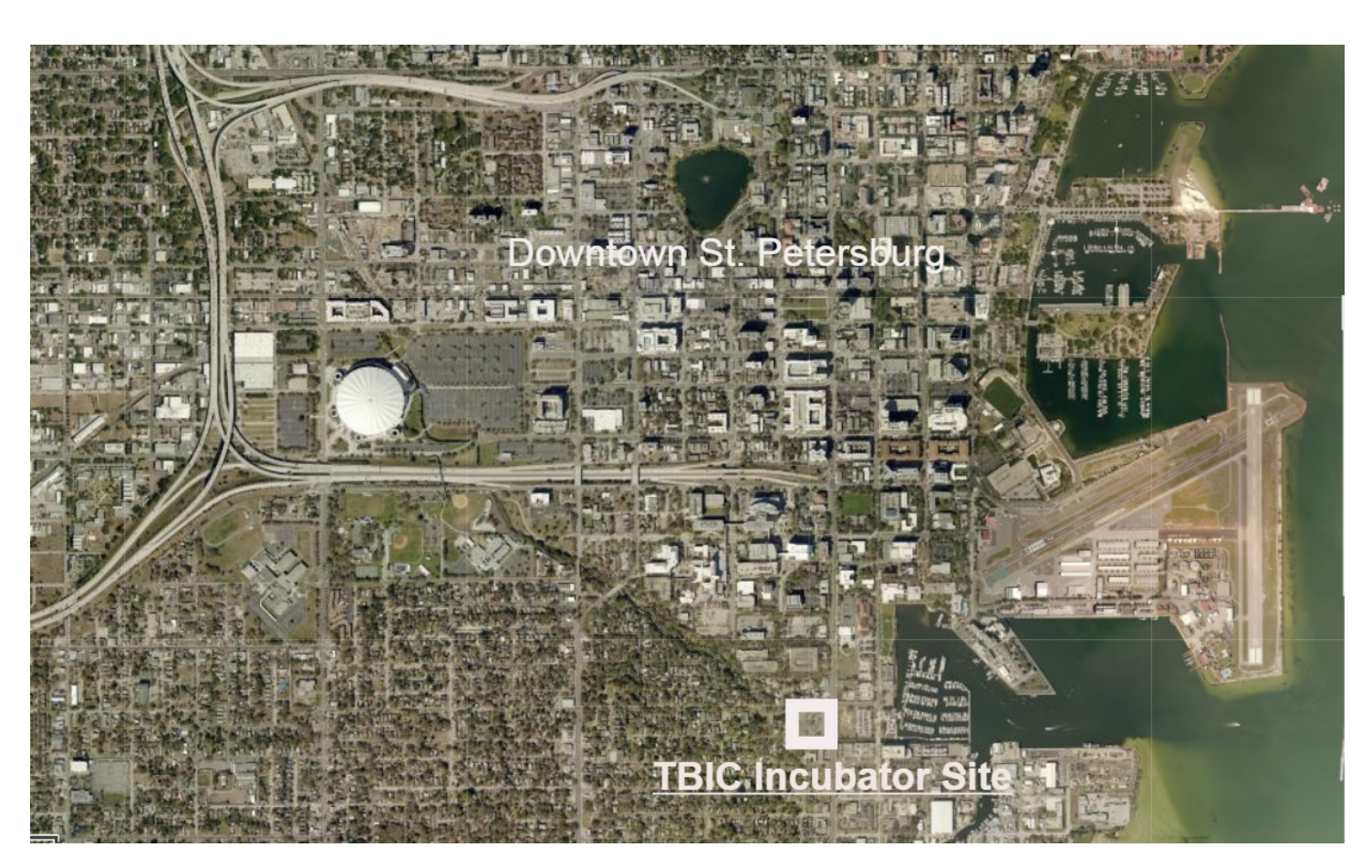
3. Zoning Map: