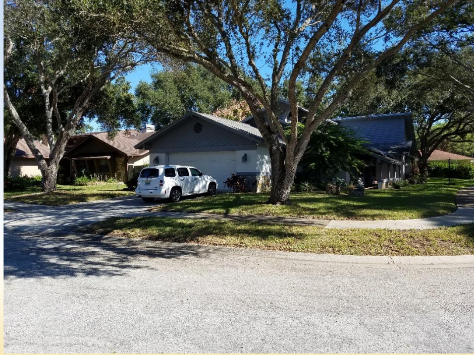
View of houses across 123rd St N