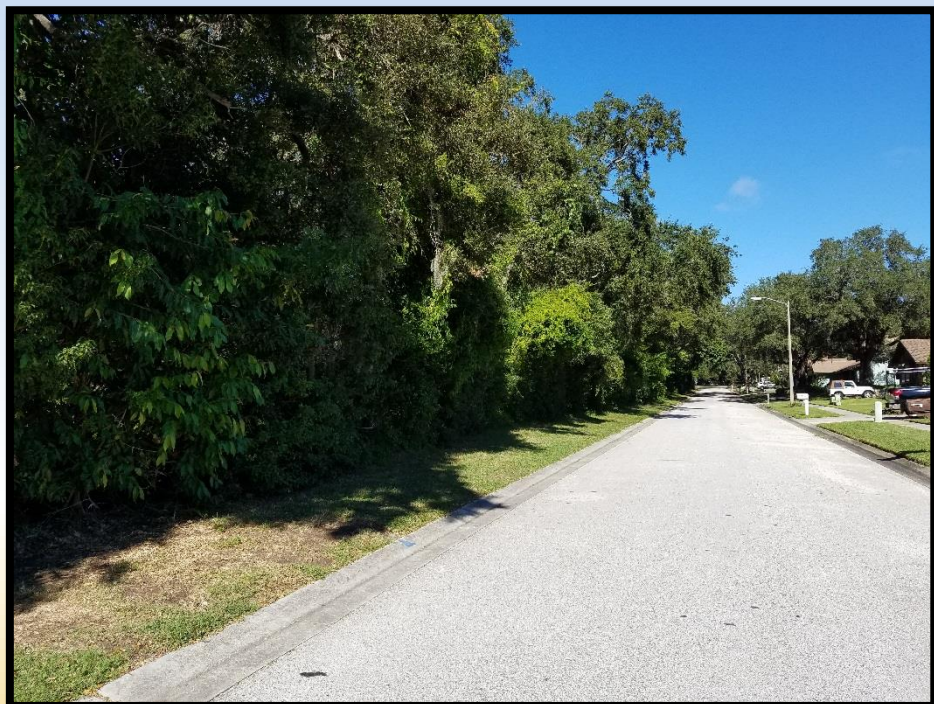
Looking west at subject site from 123rd Street N.