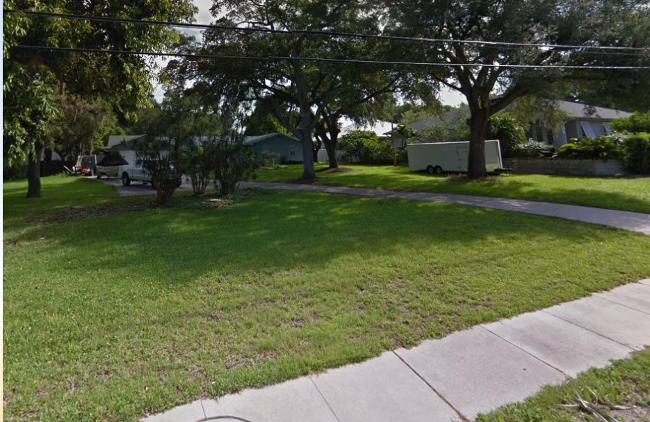
County Park to the west