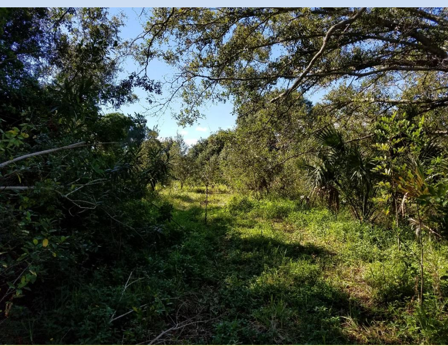
Looking west at subject site from 123rd Street N.