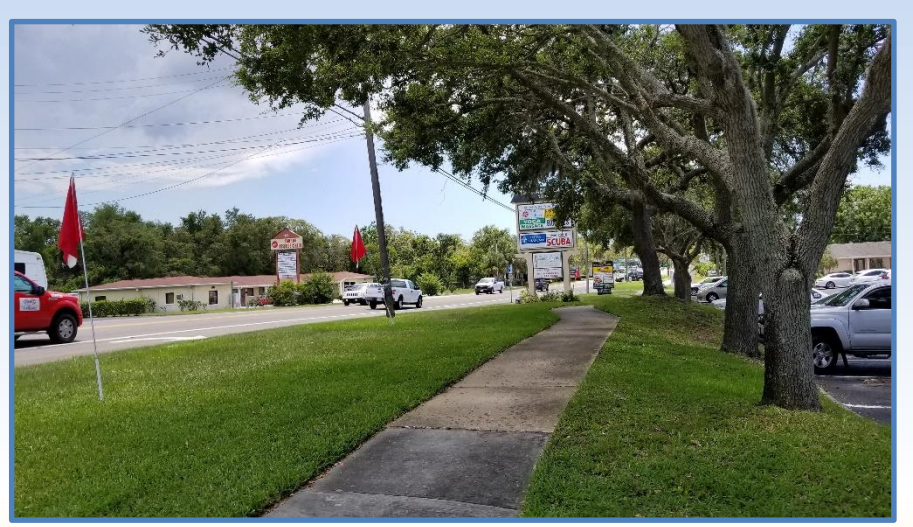
Looking north and south along Alt US-19