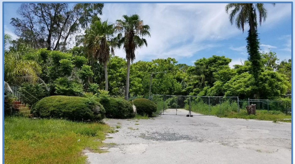
View of subject property along Alt US-19