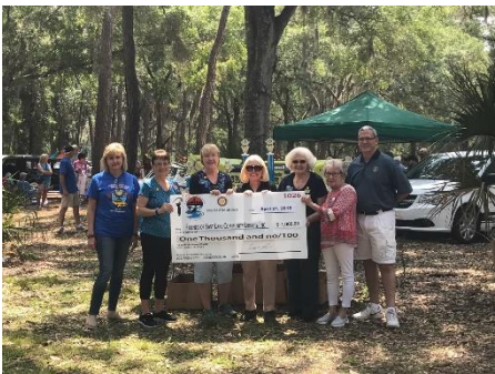
Rotary Club Car Show