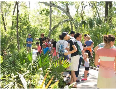
Family Friday Fun @ Brooker Creek Preserve