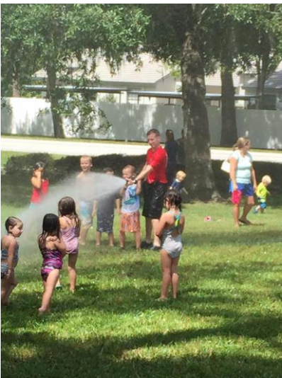
East Lake Fire Rescue “Hosedown”