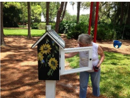
ELCL Friends’ “Little Free Libraries” throughout the community