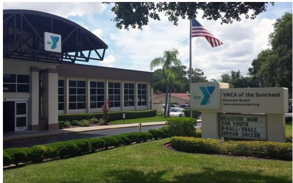
YMCA of the Suncoast Cooperative Programming