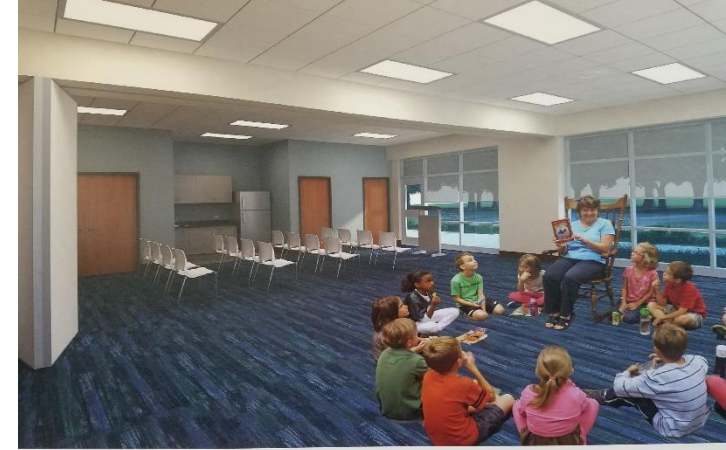
New Community Room for East Lake Community Library

PLUS... Three new databases with remote access from home!