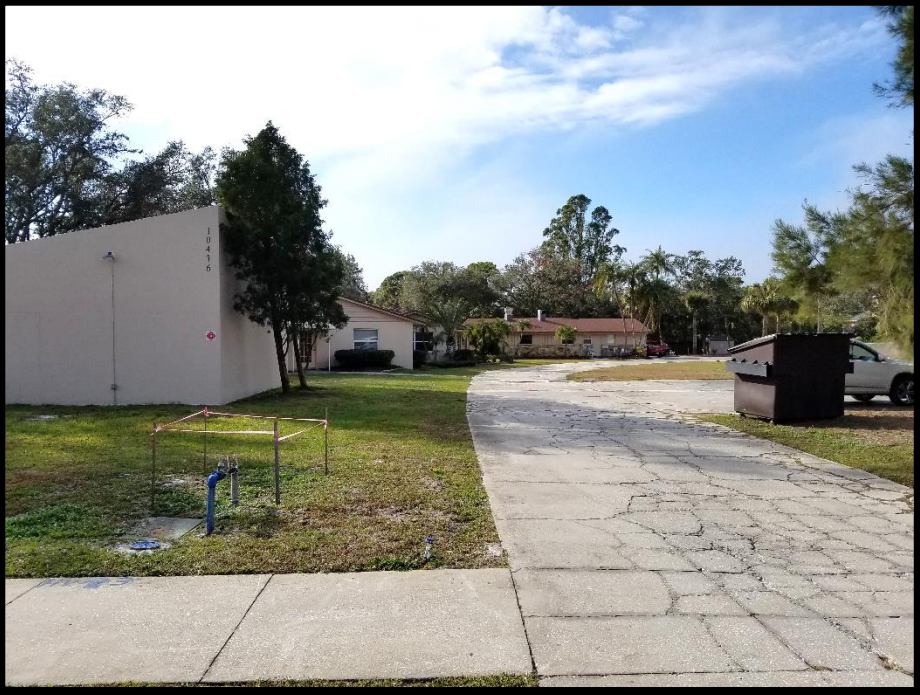
Adjacent Institutional Uses