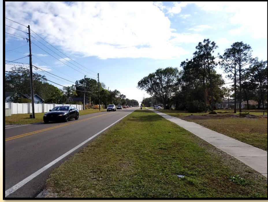
Residential across 131st Street N.