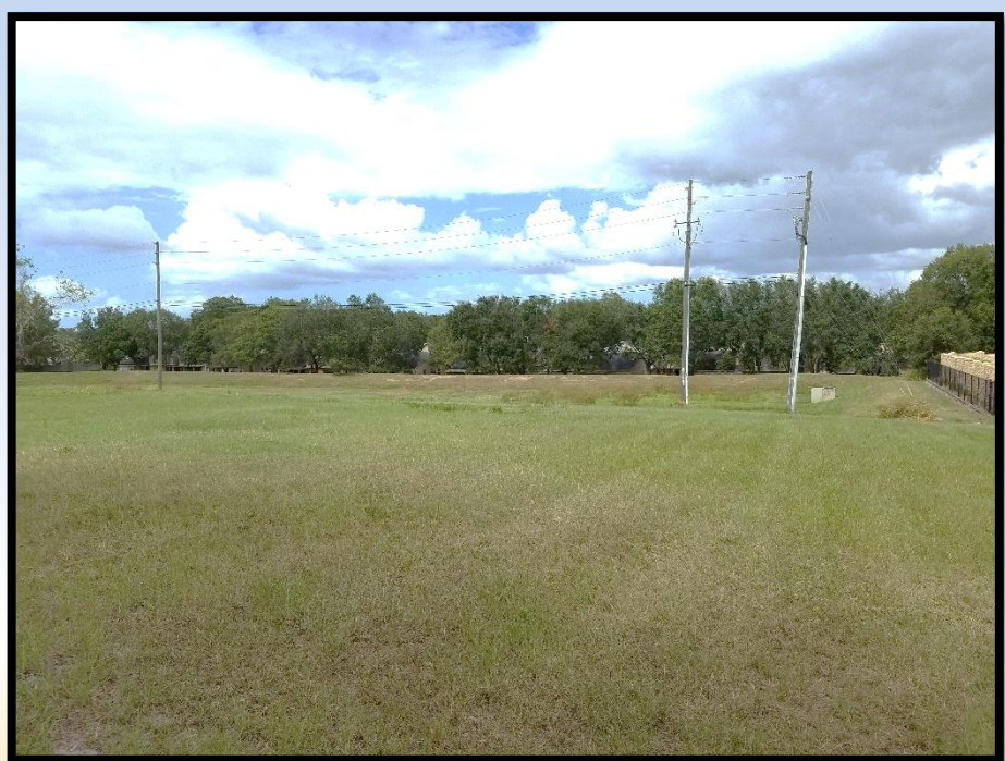
Adjacent area to the west