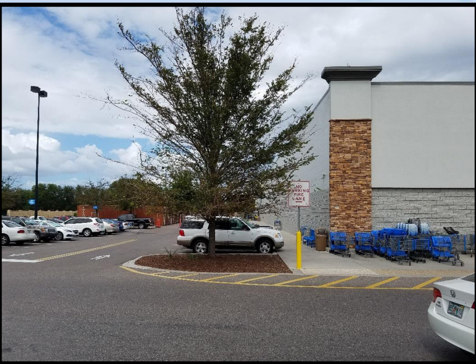
Location of proposed building addition