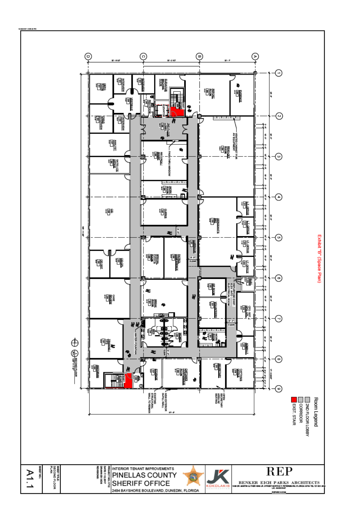
Page 28 of 41