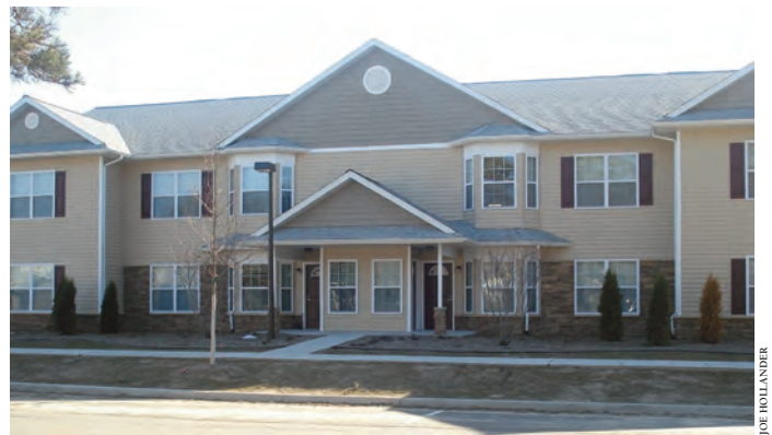
Gateway Village Apartments in Frankfort, Michigan.

In the grand scheme of things, 36 affordable apartments may not sound like a lot, but in a small city like Frankfort located in a rural county facing a lack of workforce housing, the apartments have been a valued addition.