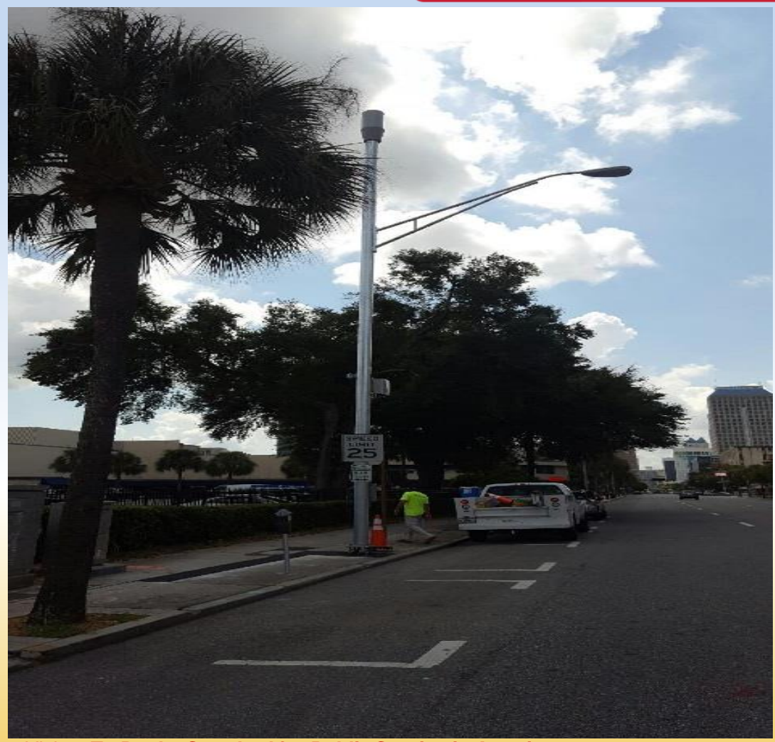
Our Vision: To Be the Standard for Public Service in America