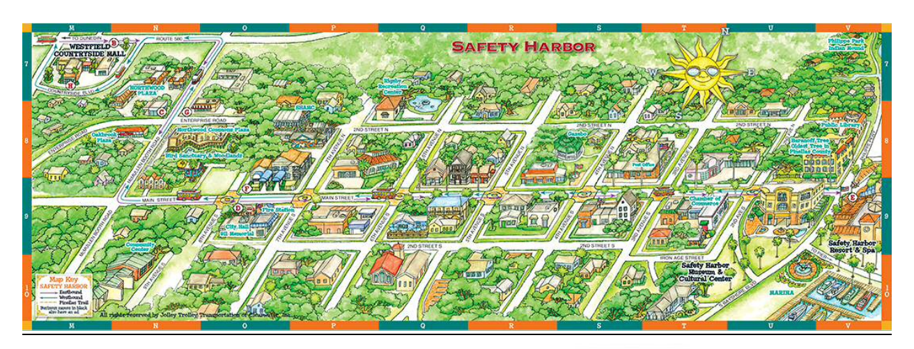
EXHIBIT C The Safety Harbor Route