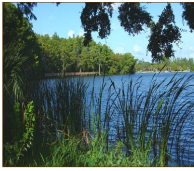
Lake Tarpon Water Quality