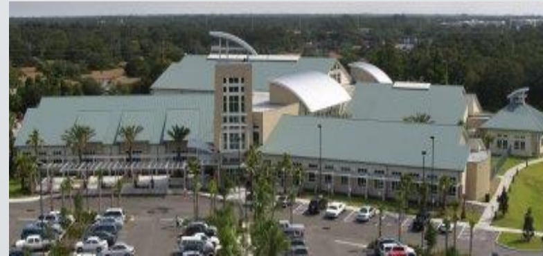
Largo Public Library