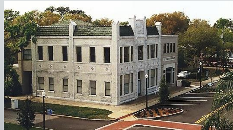
Oldsmar Public Library