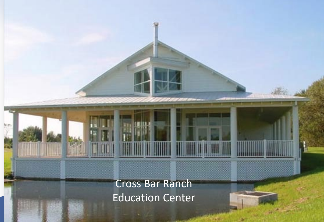
Cross Bar Ranch Education Center