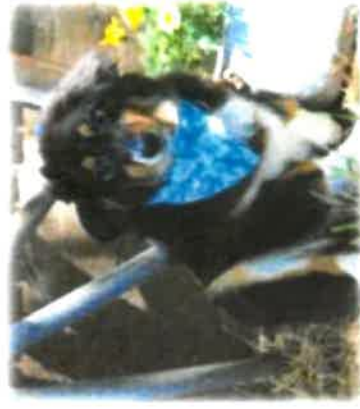
Mother: Arabia 12lbs