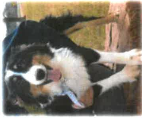
Father: Miles 20lbs