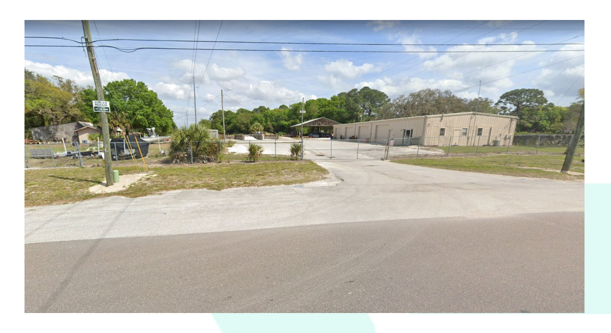
Looking east from East Lake Drive