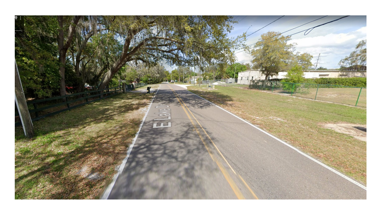
Looking north from East Lake Drive