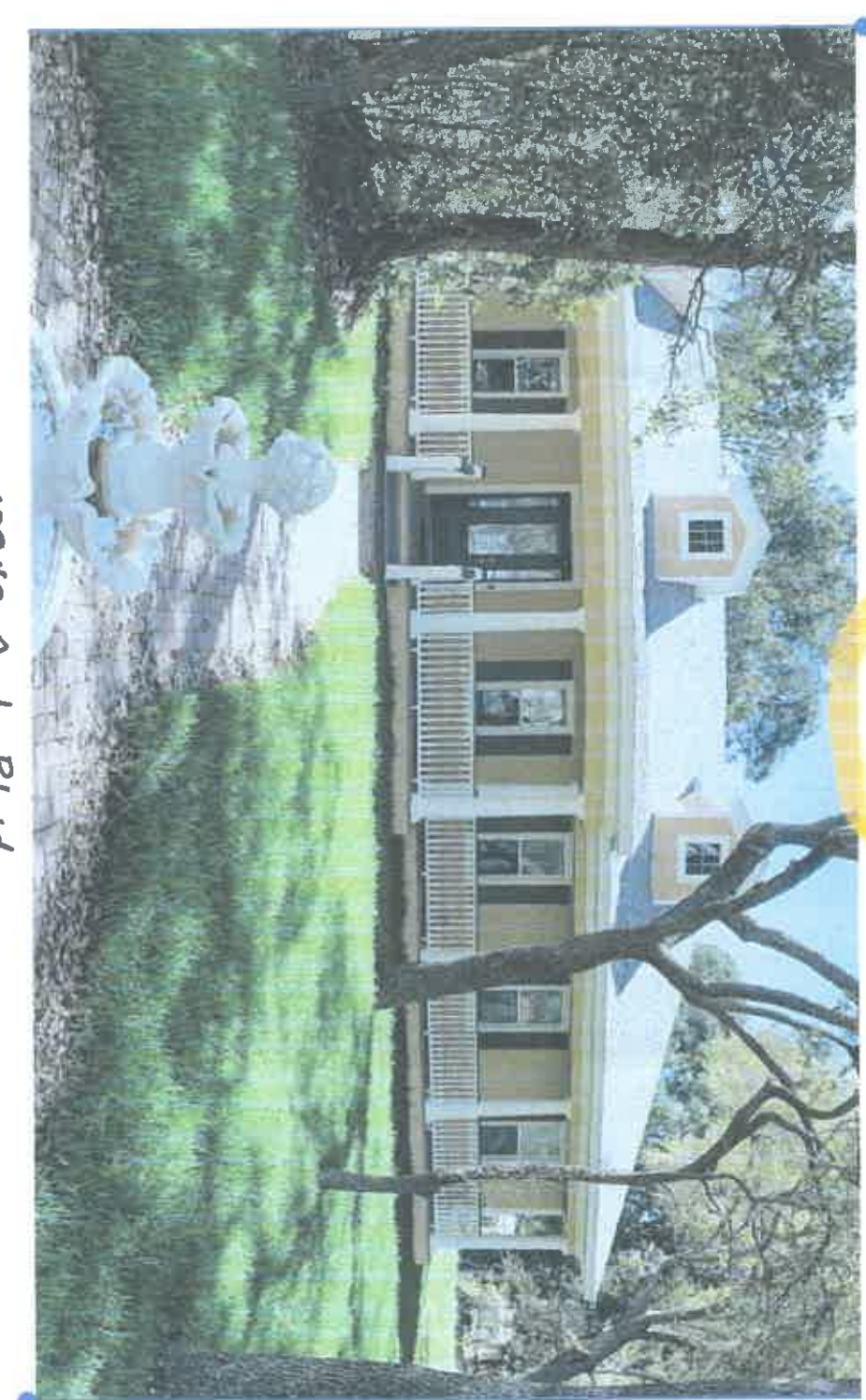
12948 Park Blvd.