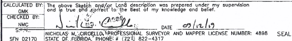
Exhibit A SHEET 1 OF 2

Additions or deletions by other than the Professional Land Surveyor in responsible charge is prohibited. Land Description is invalid without signature and/or embossed seal of the Professional Land Surveyor