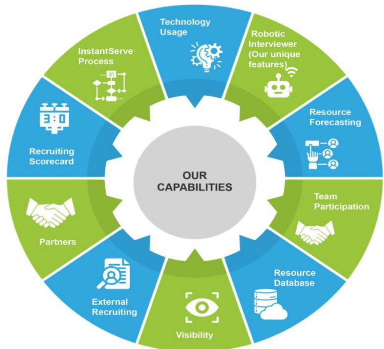
Figure 2: InstantServe – Value additions

requirements that enables us to respond quickly to requirements minimizing lead-time for onboarding staff.