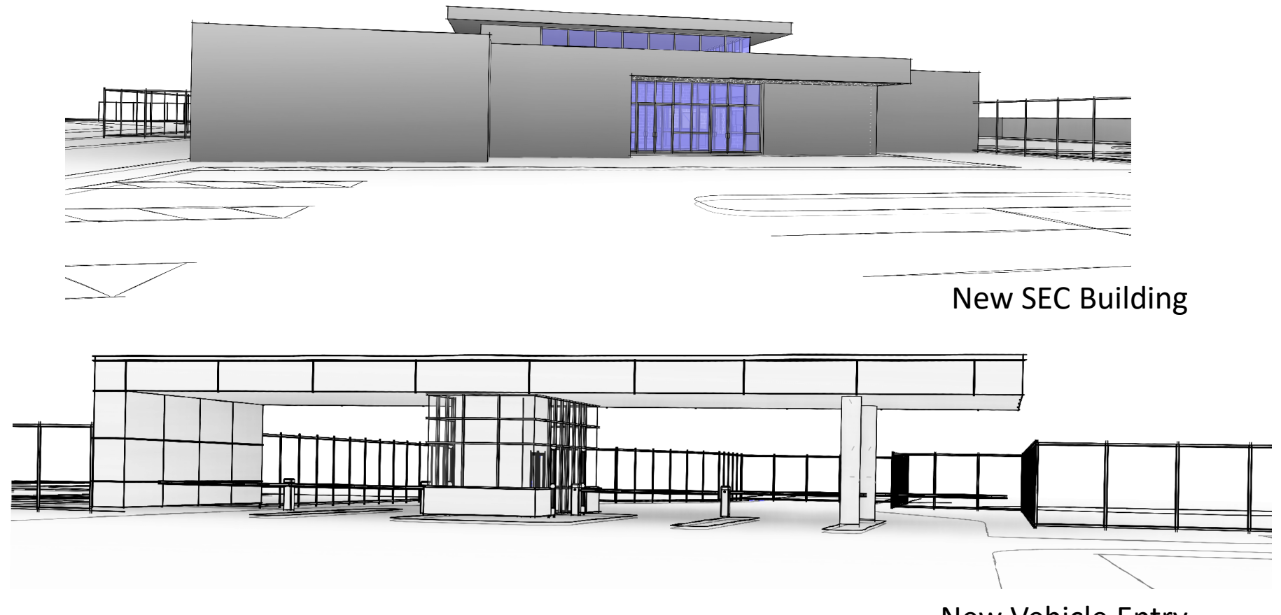
New Vehicle Entry