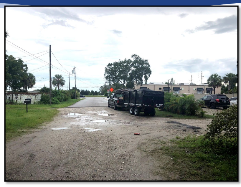
Looking east from near subject site