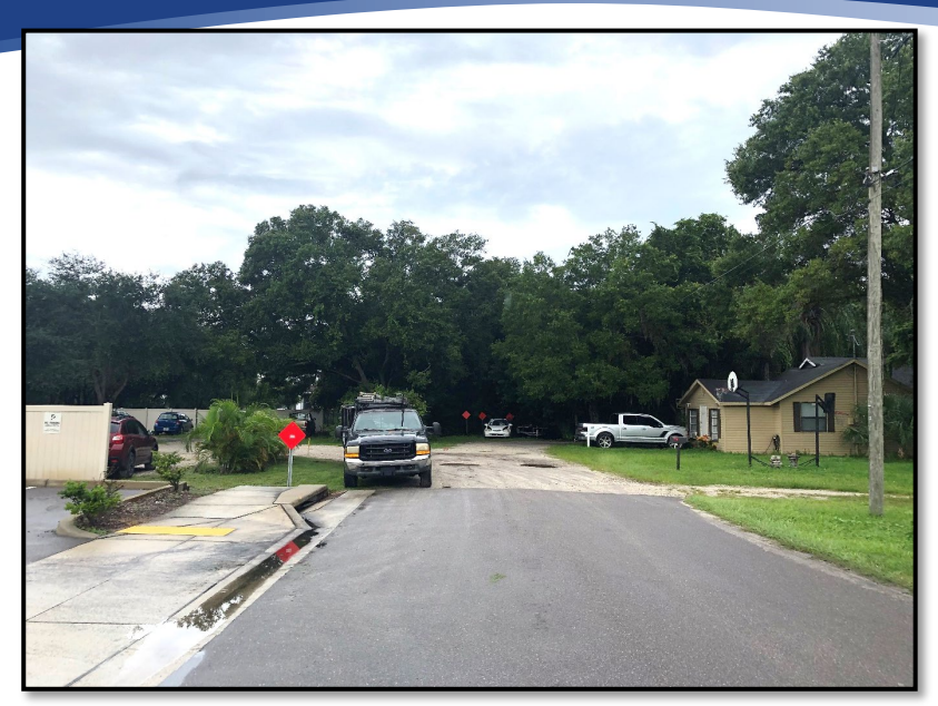
Looking west along 20th Terr SW