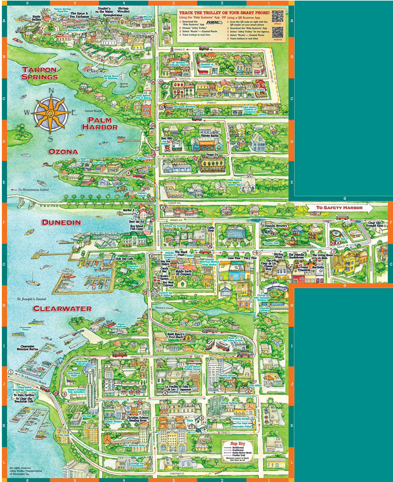
EXHIBIT A The Coastal Route