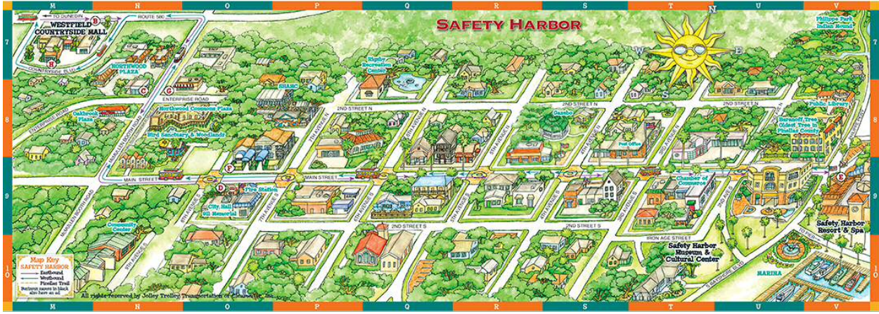
EXHIBIT C The Safety Harbor Route