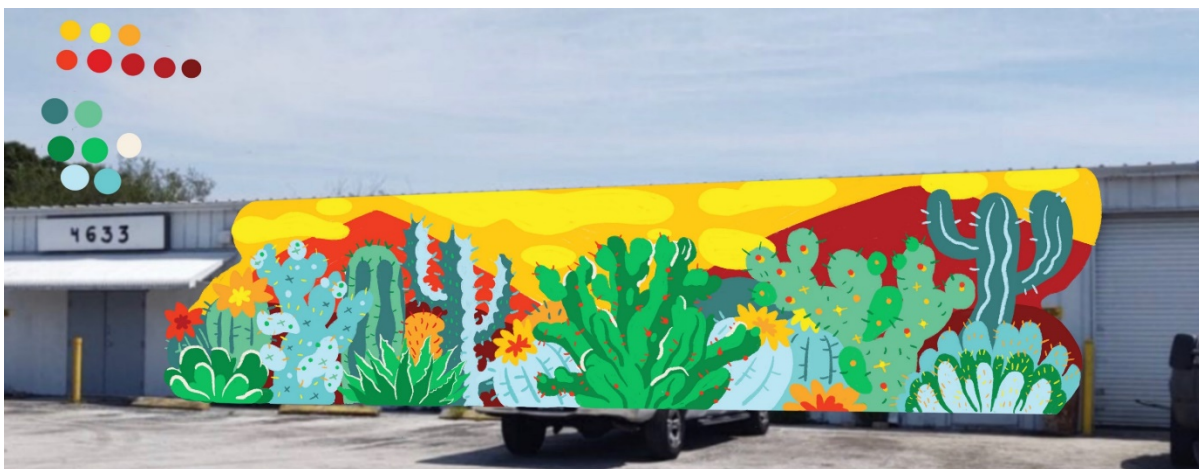
Rendering of mural design selected for Red Mesa Restaurant Group located on 28 th St. N. in Joe's Creek Industrial District