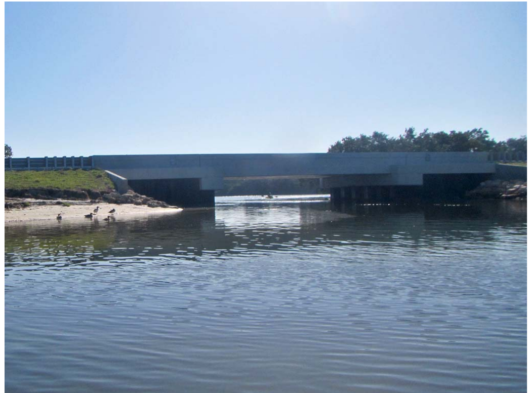
New Ft Desoto Bridge to increase flow

Pinellas County has contributed $150K during this period THANK YOU!