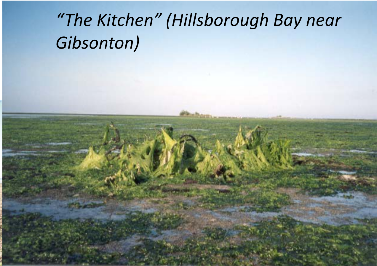
“The Kitchen” (Hillsborough Bay near Gibsonton)