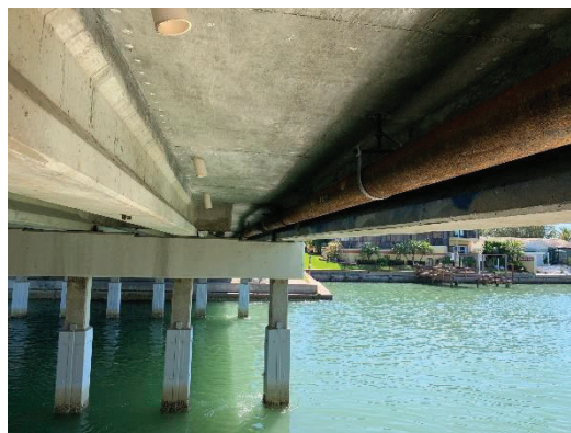
Madonna Bridge Water Line

Description: Pinellas County Utilities has and maintains existing Water and Reclaim Water Mains at the Madonna Boulevard. The existing 8" Ductile Iron/Cast Iron Pipe at the Madonna Blvd Bridge is located under the south bridge deck and is hung from pipe supports that are attached to the bottom of the deck. The existing 10" HDPE Reclaim Water Main is located north of the bridge and was installed via a Horizontal Direction Drill (HDD) in 1994.