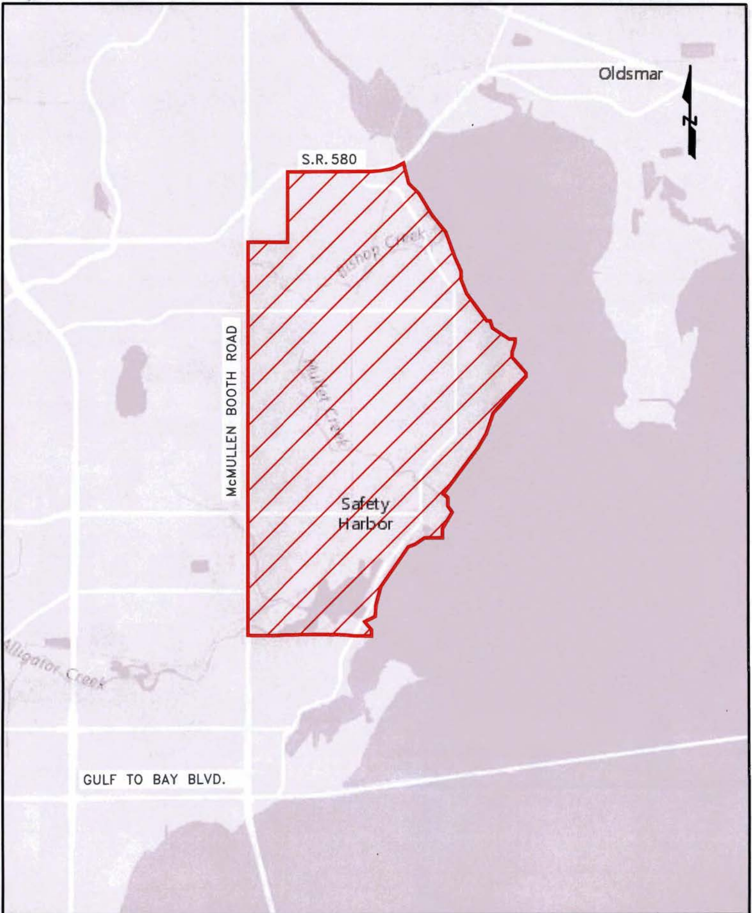
EXHIBIT "A" SERVICE AREA BOUNDARY