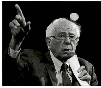
Democratic presidential candidate Sen. Bernie Sanders speaks last year at the Presidential Gun Sense Forum in Iowa.

He opposed a mandatory waiting period of five to seven days several times — twice in 1991 and twice in 1993. That second 1993 vote was against the iconic Brady Bill, which passed and was signed into law by President Bill Clinton. Named after James