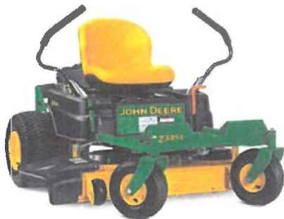
In-use/lifestyle images-accessories not included