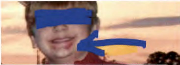
Photo of my sons mouth rash after wearing a wet mask all day – doctors suggest to keep it dry as possible. Not possible with a mask, some of these were taken earlier in the year prior to his braces being put on in Feb 2021 but they are all during the mask mandate