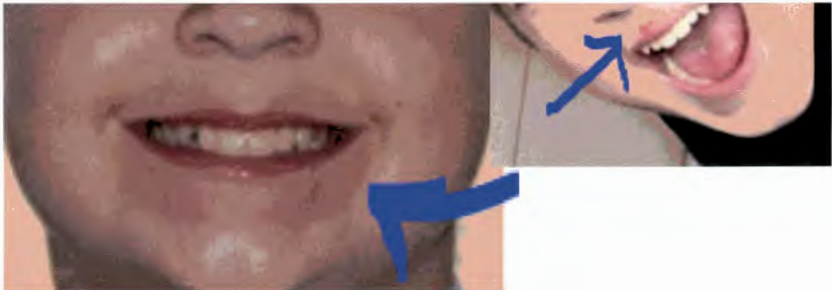
This below shows you it is starting to scar