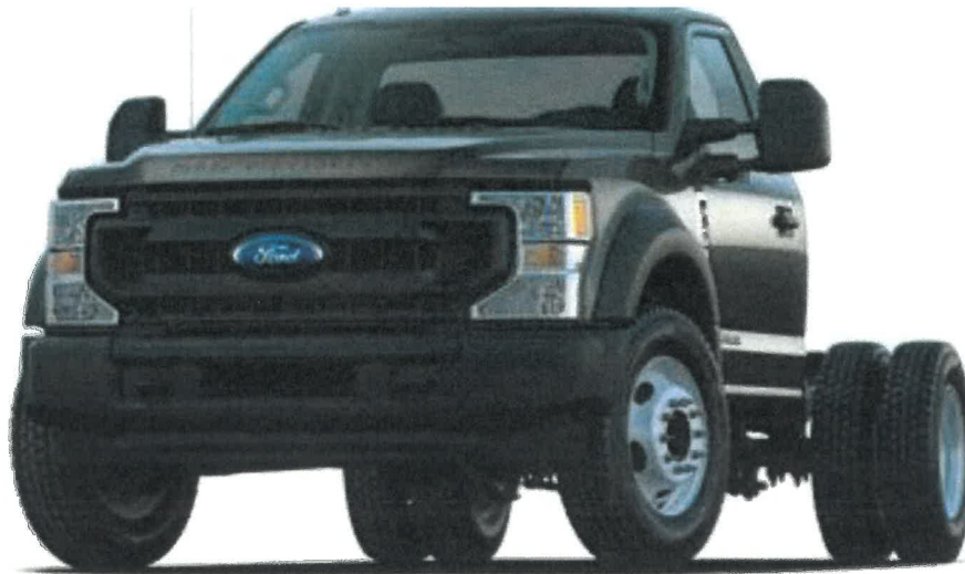
Note:Photo may not represent exact vehicle or selected equipment.

Vehicle: [Fleet] 2022 Ford Super Duty F-350 DRW (F3G) XL 2WD Reg Cab 169" WB 84" CA (✔ Complete)