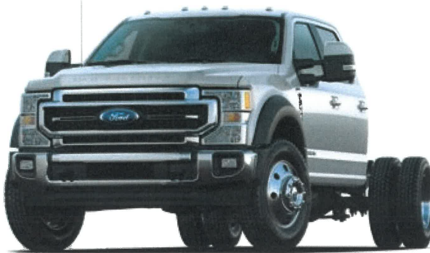
Note:Photo may not represent exact vehicle or selected equipment.

Vehicle: [Fleet] 2022 Ford Super Duty F-550 DRW (W5H) XL 4WD Crew Cab 179" WB 60" CA ( Complete )