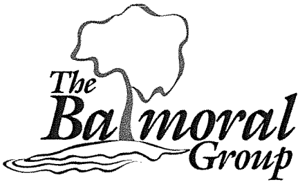
Exhibit A Wage Rates The Balmoral Group