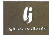
EXHIBIT A - HOURLY RATE SHEETS