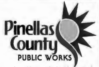
EXHIBIT PA F

SECTION(S) 8, TOWNSHIP 30 SOUTH, RANGE 15 EAST