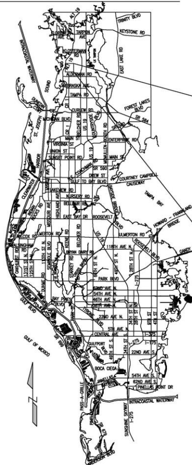
PINELLAS COUNTY LOCATION MAP