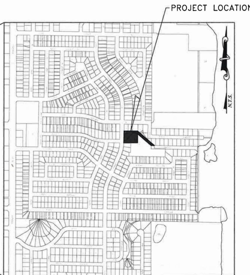
SECTION 16, TOWNSHIP 30 SOUTH, RANGE 16 EAST