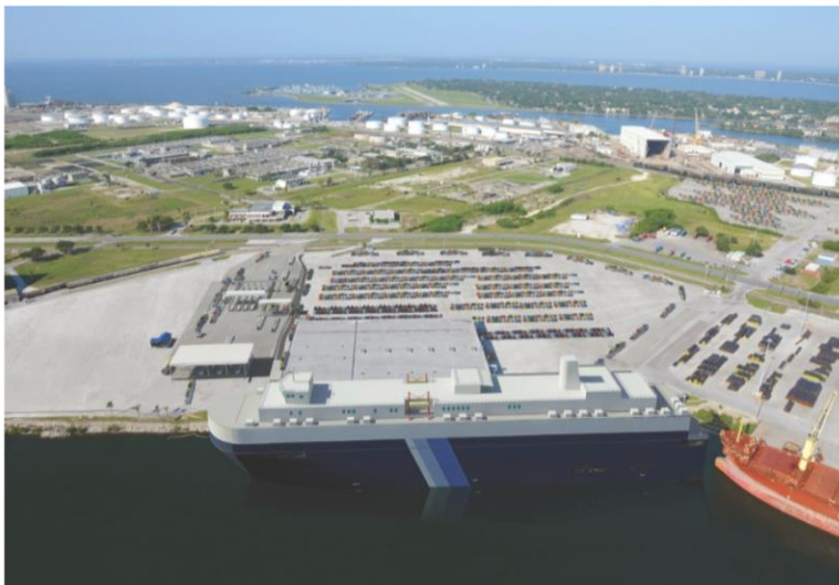
Auto Terminal - AMPORTS