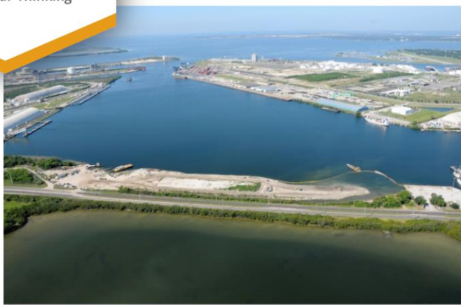
Land Development - Eastport