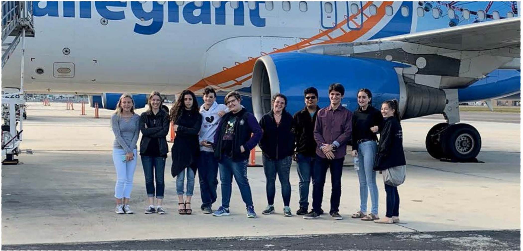
YAC @ PIE Airport!