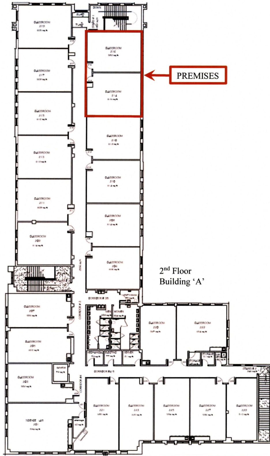
EXHIBIT "A" Space Plan