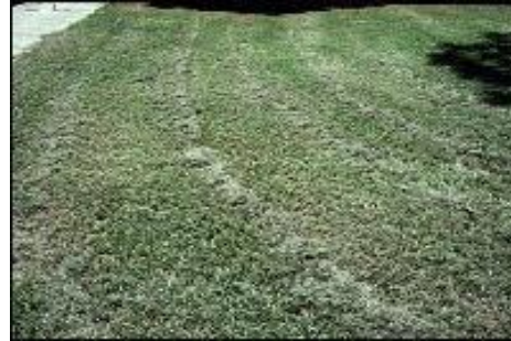
Figure 2 - Remove Large Clumps of Clippings by Mechanical Blowing or Collecting